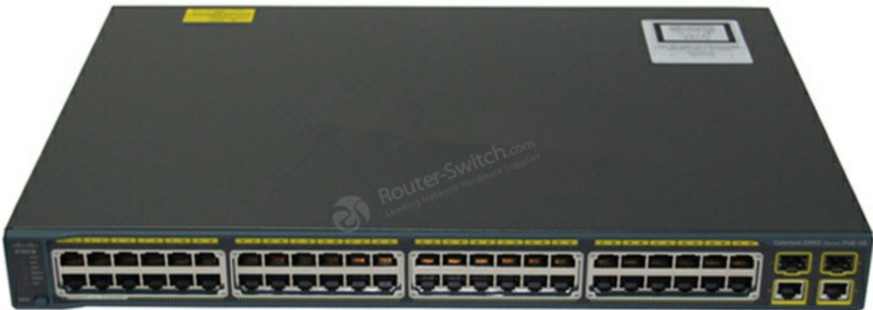
Table 1 shows the Quick Spec of the WS-C2960-48PST-S.

Figure 1 shows the appearance of the WS-C2960-48PST-S.