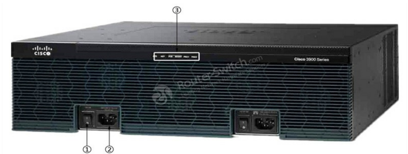
Figure 1 shows the front panel of the CISCO3945-V/K9.