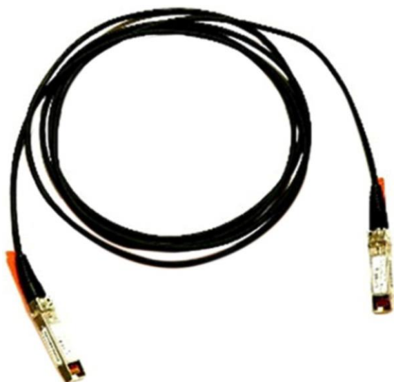
Figure 3. Cisco direct-attach twinax copper cable assembly with SFP+ connectors

Cisco SFP+ Copper Twinax (Figure 3) direct-attach cables are suitable for very short distances and offer a cost-effective way to connect within racks and across adjacent racks. Cisco offers passive Twinax cables in lengths of 1, 1.5, 2, 2.5, 3 and 5 meters, and active Twinax cables in lengths of 7 and 10 meters.