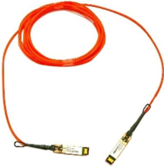
Figure 4. Cisco direct-attach active optical cables with SFP+ connectors